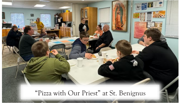
"Pizza with Our Priest" at St. Benignus