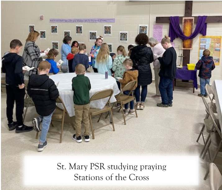
St. Mary PSR studying praying Stations of the Cross